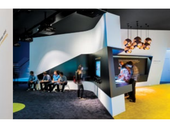
Clockwise from top left: In this temporary pavilion at SAP, a suspended canopy incorporates halogen fixtures. A computer rendering shows the form of the 2,400-square-foot structure. Multimedia presentations are projected on a wall. Custom copper pendant fixtures hover near built-in interactive components. The reception station is acrylic composite. Portholes are flush-mounted glass.