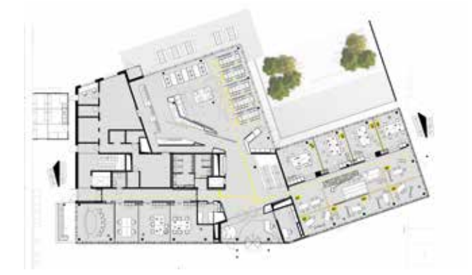
← | Collaboration room , for short meetings ↑ | Plan ↓ | Design lab, with whiteboards